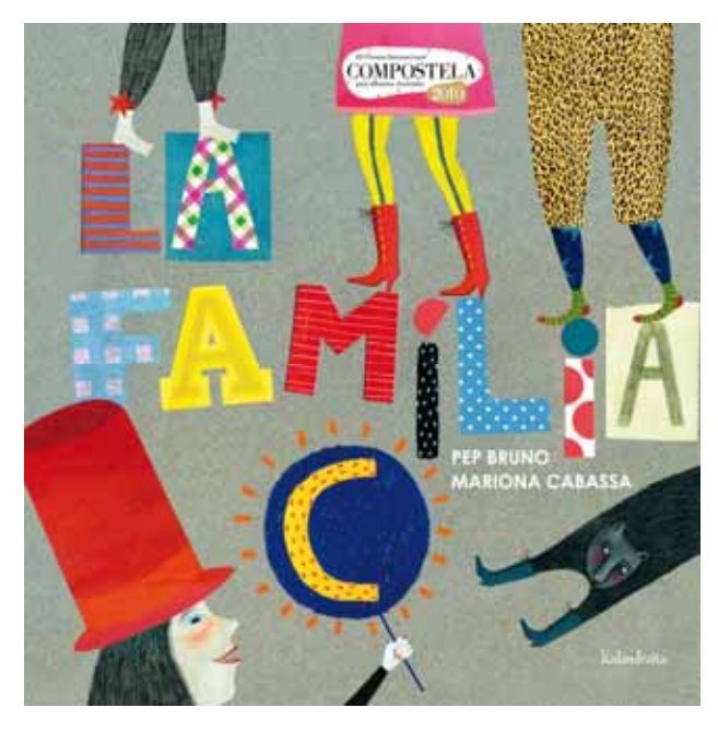
III INTERNATIONAL COMPOSTELA PRIZE FOR PICTURE BOOKS